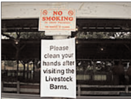
Ford County Fair