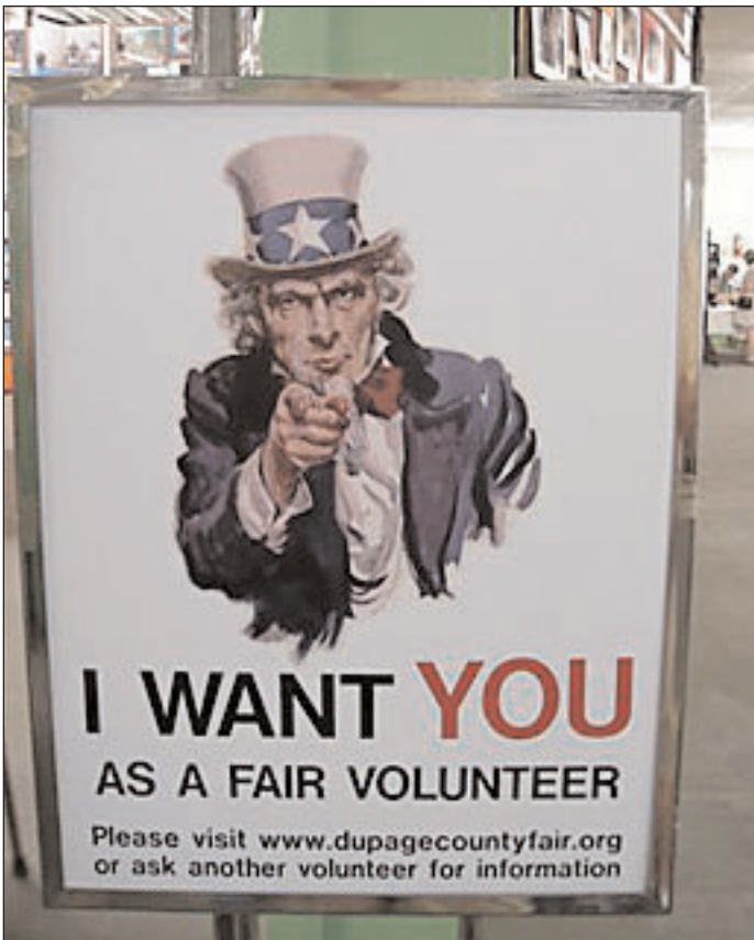
This sign posted at the DuPage County Fair really tells the story behind a successful fair. Volunteers.