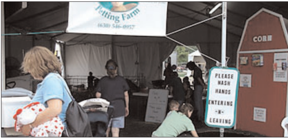
DuPage County Fair