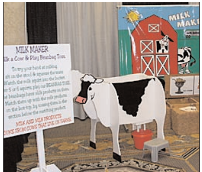
first come basis from the IAFE. They are a great family learning activity. Come, see, learn and enjoy.