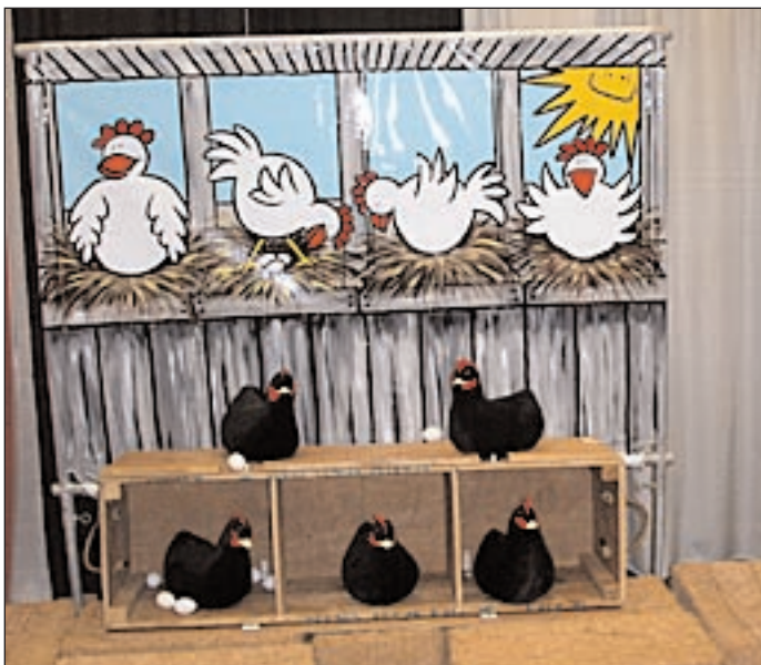
"Farmer for a Day" and "Milk Maker" exhibits will be on loan from the IAAF and Events Unlimited at the Illinois Convention. These displays are available on a